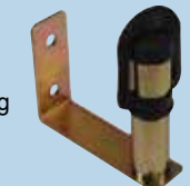
VLC2188 Heat shrink sleeve pack