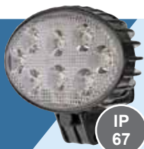
VLC6087 LED Work lamp