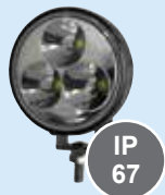
VLC6139 LED Work lamp