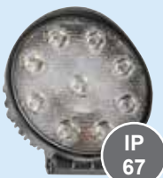
VLC6089 LED Work lamp