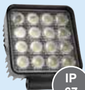
VLC6088 LED Work lamp

Vapormatic's range of LED work lamps are suitable for many agricultural, commercial and industrial applications. The range of heavy-duty 'premium' work lamps are manufactured from die-cast aluminium with tough acrylic lenses and can be powered by a 10~30Vdc power source.