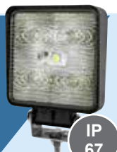
VLC6135 LED Work lamp

Vapormatic's Slimline range of LED work lamps are ideal for applications where a shallow fitting profile is required. All Slimline lamps are available with a FLOOD illumination pattern. All Slimline lights are manufactured from die-cast aluminium with tough, impact and chemical resistant polycarbonate lenses.