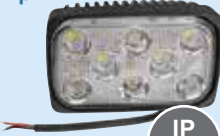
VLC6115 LED Work lamp