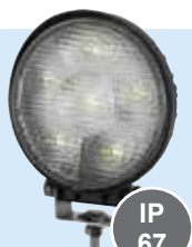
VLC6136 LED Work lamp