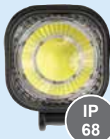
VLC6111 LED Work lamp