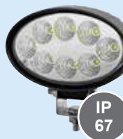
VLC6137 LED Work lamp